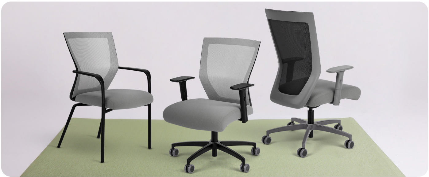
Guest chair #931