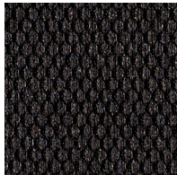
Revere Black Express Upholstery