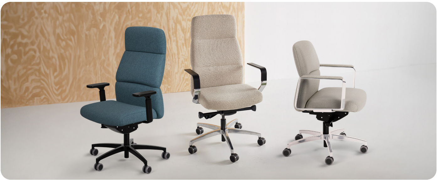
High backs #875