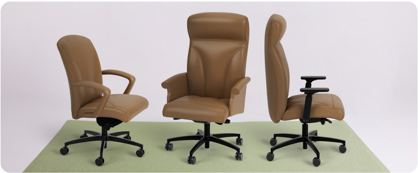
Mid back #7101