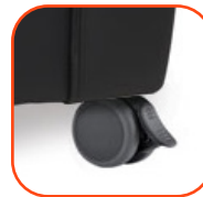
Dual Wheel Casters