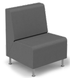
6321 Lounge Chair