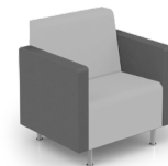
-----L/-----R Left Arm/Right Arm