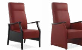
74310 Wood Arms 74311 Upholstered Arms Fixed Seat