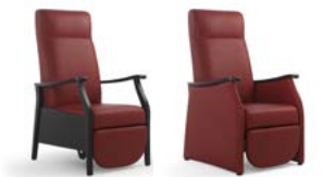
74330 Wood Arms 74331 Upholstered Arms Motorized Recline