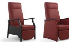
74320 Wood Arms 74321 Upholstered Arms Manual Recline