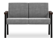
6620 Free Span Guest Seating