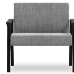
6623 Guest Bariatric 30"