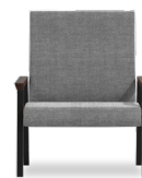
6627 Patient Bariatric 30"