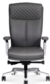
Diamond stitching available on high & mid backs.